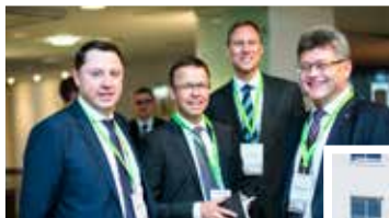
Photos from Nordic Baltic Bioenergy in Vilnius 2016.